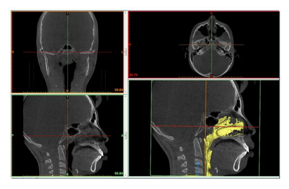
Fig. 1: Clinical radiograph of case using Myobrace (T4ATM): Before treatment CBCT

luate three dimensional changes after Myobrace (Myofunctional Research Co, Australia) appliance treatment for the children with OSAS symptoms (Fig. 1, 2). Our study confirmed the increase of oropharyneal airway dimension using Myobrace (Fig. 3). We excluded the sleep symptoms of the participating patients.