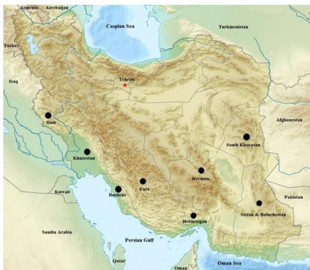
Fig. 1: Map showing the study areas in Iran, 2008-2014 http://www.freeworldmaps.net/asia/iran/map.html

Field collections were conducted three times (May/Jun, Sep, Oct/Nov) during 2008-2014, coincident with mosquito activity in the provinces of Sistan & Baluchestan, Hormuzgan, Bushehr, Kerman, Khuzestan and Korasan-e-Jonobi and 1 or 2 times only in the other provinces (Fig. 1).