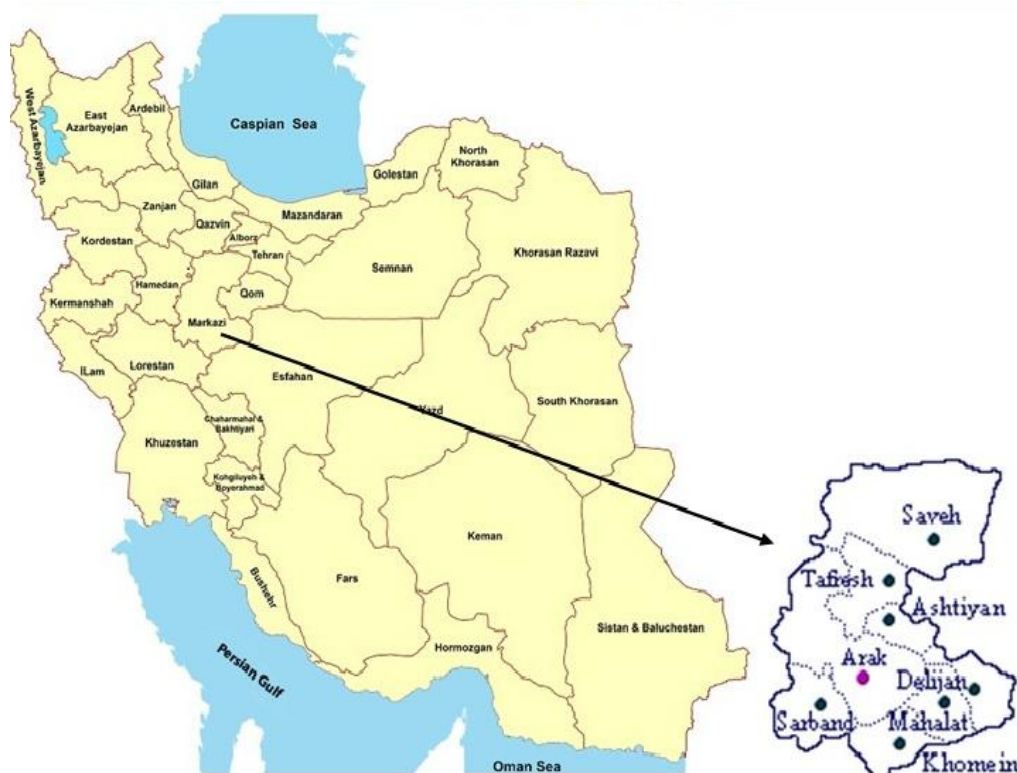
Fig. 1: Map of Iran and Arak as the studies area

Arak City located in central Iran in Markazi Province, and surrounded by mountains in the west, east and south with and latitude , 34° 19' 59 N and longitude of 49° 49' 59 E. It is the center of province and the population is 76923300 according to the last census in 2006 that at least one fifth of them live in the urban areas ( http://www.horologeparlante.com/time-ost%C4%81n-e-markaz%C4%AB-iran-TIMEus124763r.html ). The city consists of 4 urban and 9 rural regions (Fig. 1).