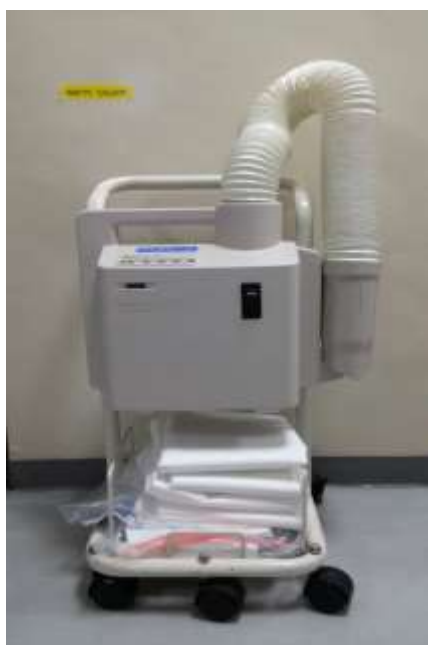
Fig. 1: WarmTouch™ manufactured by Covidien

We investigated ELF-EMF from convective air warming device on various temperature selection and distance for guideline to protect medical personnel and patients.