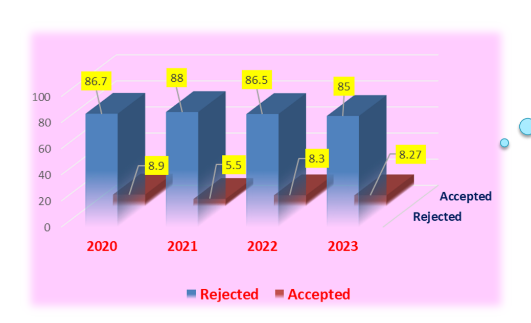
Fig. 2: The percentage of acceptance and rejection rate during 2020-23.