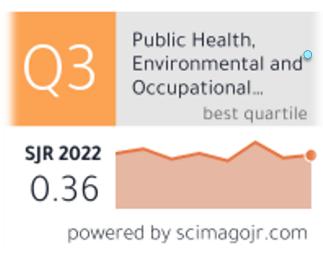
Fig. 4: Key Indicators announced by Scimagojr.com for the year 2022.