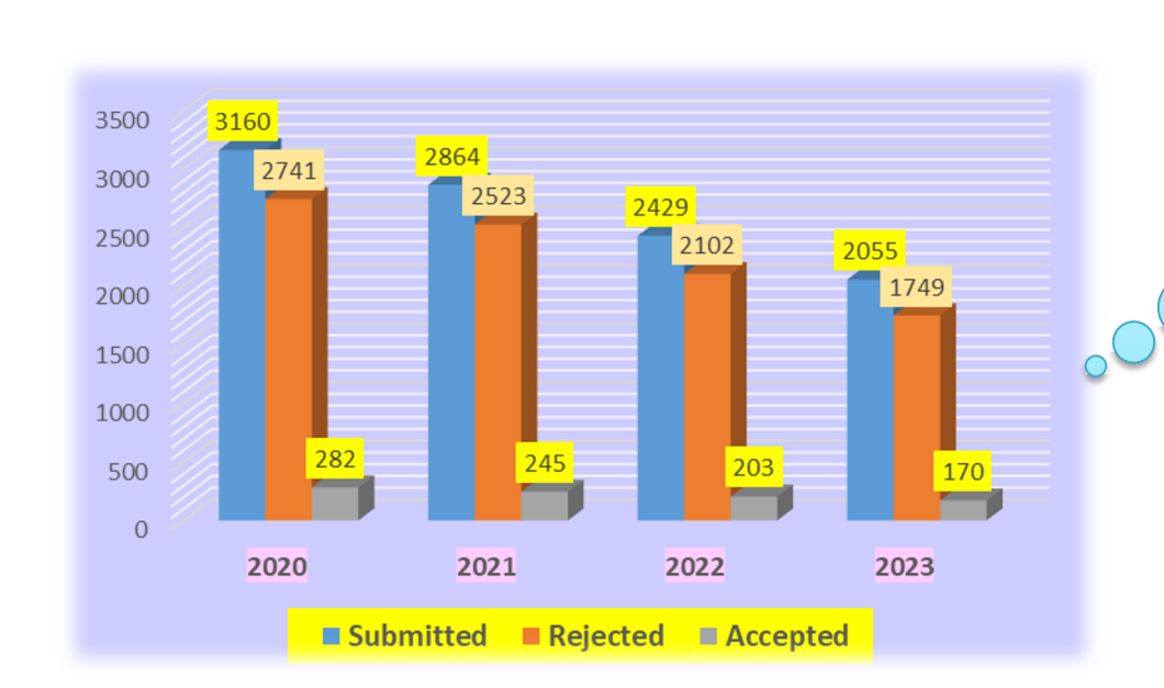
Fig. 1: Total number of articles submitted during 2020-23 in the context of the frequency of submission, rejection and acceptance rate.