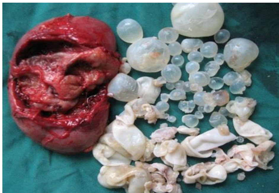
Fig. 2: The excised kidney and multiple daughter cysts

The patient was scheduled for surgical exploration. But albendazole treatment was started as a 4-week cycle prior to operation and was continued after it. Because of extensive involvement of kidney and history of hydatiduria, simple right-sided nephrectomy was performed through a subcostal extra-peritoneal flank incision and retroperitoneal cavity was irrigated with hypertonic saline solution. In renal specimen, the collecting system was filled with massive numbers of daughter cysts (Fig. 2, 3).