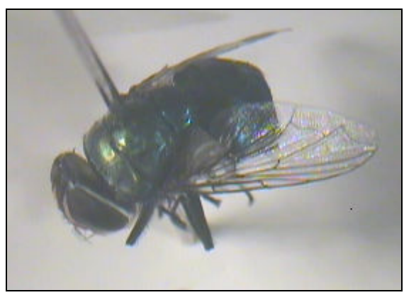
Fig. 2: The adult fly of Chrysomya bezzianna (original photos), magnification: ×10