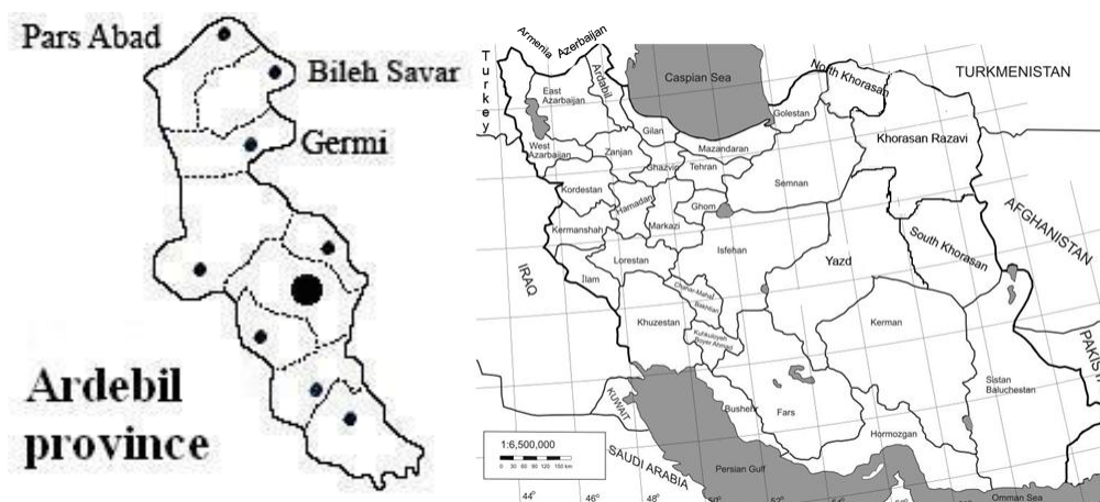
Fig. 1: Moghan Plain, comprising three counties of Pars Abad, Bileh Savar and Germi in northern parts of Ardebil province, northwestern Iran