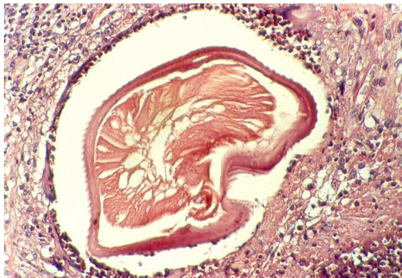
Fig. 2: Section of D. repens with external longitudinal cuticular ridges and a well-developed muscle layer