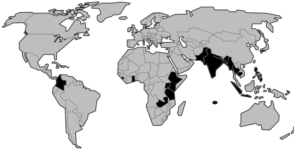
Fig. 3: Geographical distribution of SA studies