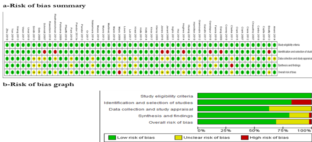
Fig. 2: Review authors' judgements about each risk of bias item presented as percentages across all included studies, a-Risk of bias summary, b-Risk of bias graph

about concerns in that domain with criteria low, high, or indefinite. Evaluators in the final decision report the risk of bias in general, with signaling questions and supportive information on the low, high, or uncertain risk of bias (10). Two authors independently evaluated the quality of systematic reviews and agreed in case of the dispute through discussion Fig. 2. Review manager 5.3 was used to draw the risk of bias summary and risk of bias graph.