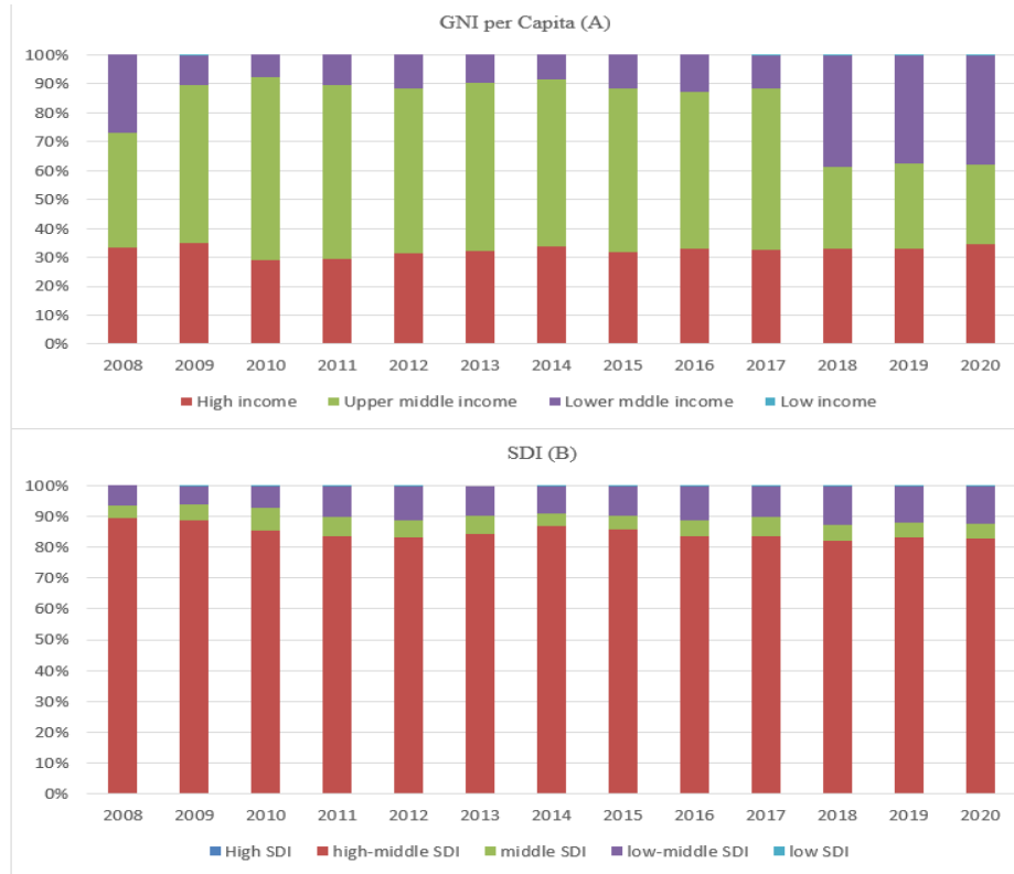
Fig. 3: Publication patterns of MENA countries in obesity research during 2008-2020, according to GNI per capita levels (A) and SDI (B)

Further investigations indicated the great share of publications among countries with high-middle SDI and upper-middle-income countries (Fig. 3). According to this figure, the overall production of upper-middle-income countries was increased from 242 in 2008 to 1046 in 2020.