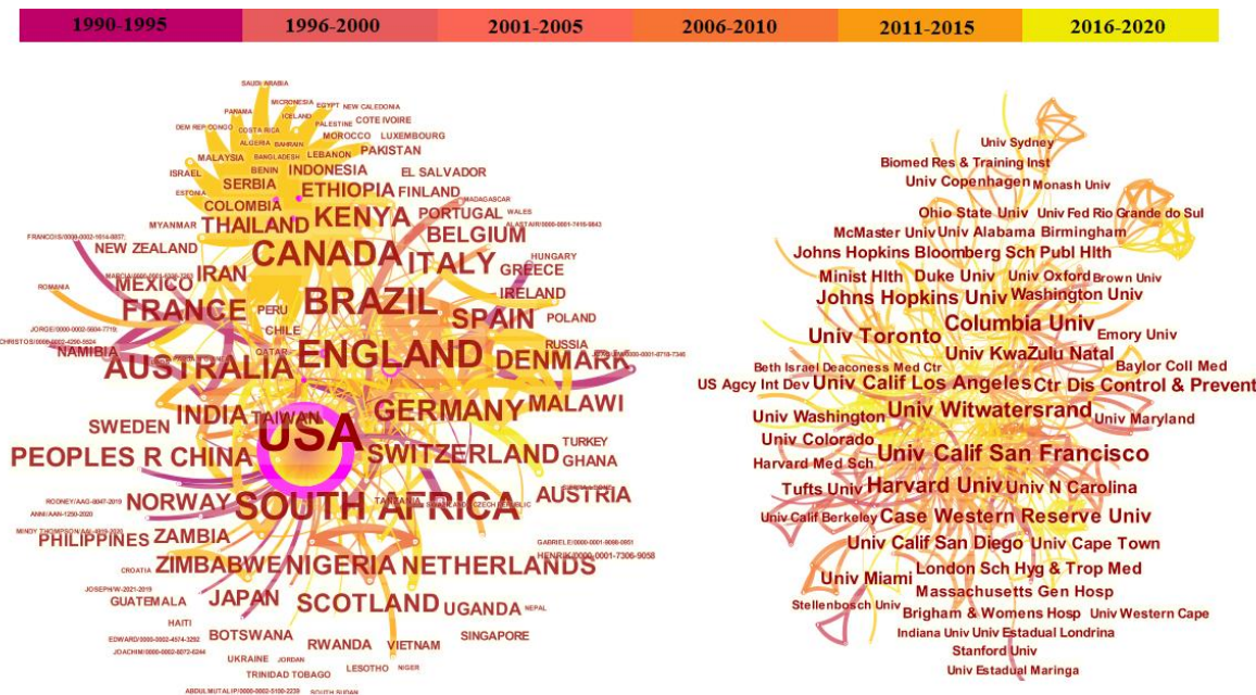
Fig. 1: Institution and country collaboration

connections between nodes gave insight about the collaborations. The colors in the network represented the collaborations and the density of collaborations between nodes in parallel with the time scale shown at the upper side of the Fig. 1. The size and thickness of the circle around the nodes exhibited the centrality level of the actor in the network.