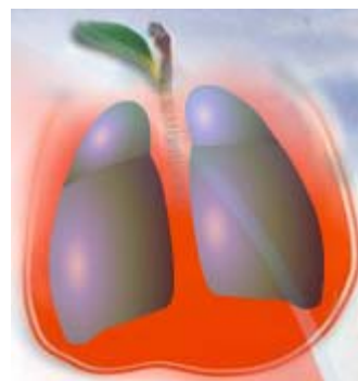
The 2nd Iranian Asthma Meeting 14-16 November 2005 Tehran, Iran

The Chair has contributed to an important international congress on immunodeficiency disorders in February-March 2005 as well as another meeting on Asthma in November 2005. The Chair has also contributed to the Environmental workshops and Scientific Writings workshops and is going to support a post-graduate course on psychotherapeutic (non-pharmacological) interventions in substance abuse.