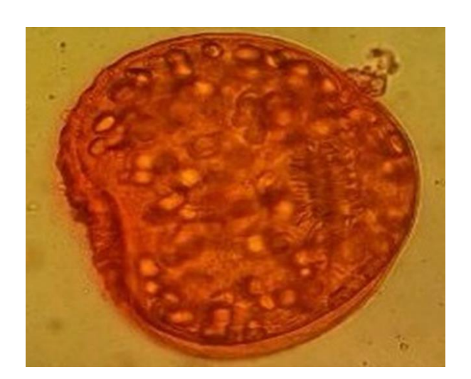
Fig. 2: Dead protoscoleces of E. granulosus which appeared to red after thawing

Dimethylsulfoxide (DMSO) and glycerol were used separately as cryoprotectants in our experimental procedures. In order to prepare different concentration of each cryoprotectant, the appropriate amount of each cryoprotectant was added to pellet of protoscoleces in RPMI 1640 where the final concentrations were reached to 5%, 10%, 15%, and 20 %.