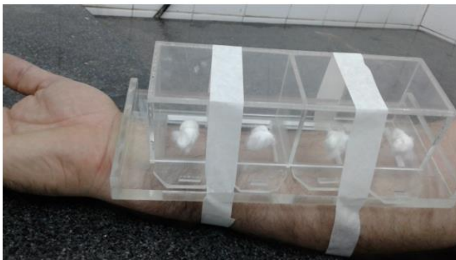
Fig. 1: K&D module apparatus with slightly modification at four cells and bottom concave conformed to the curvature of a human forearm