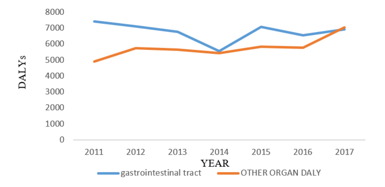
Fig. 1: Compare gastrointestinal tract DALYs with Other Organs DALYs