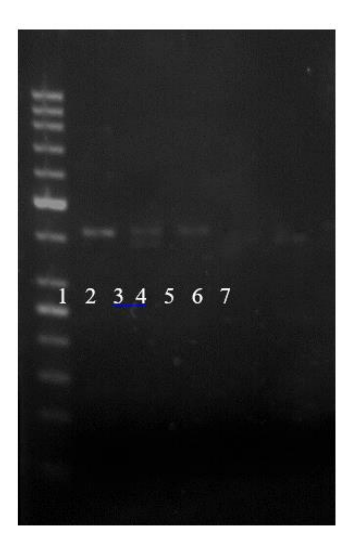
Fig. 3: Analysis of the variable number of tandem repeats (VNTR) polymorphism in intron 4 of the eNOS gene. The 420-bp band indicates five 27-bp repeats, and the 393-bp band indicates four 27-bp repeats. Lane 1: 50 bp DNA Ladder Lane 2, 3 4b/4b, Lane 5, 6: 4a/4a Lane 3: 4b/4a