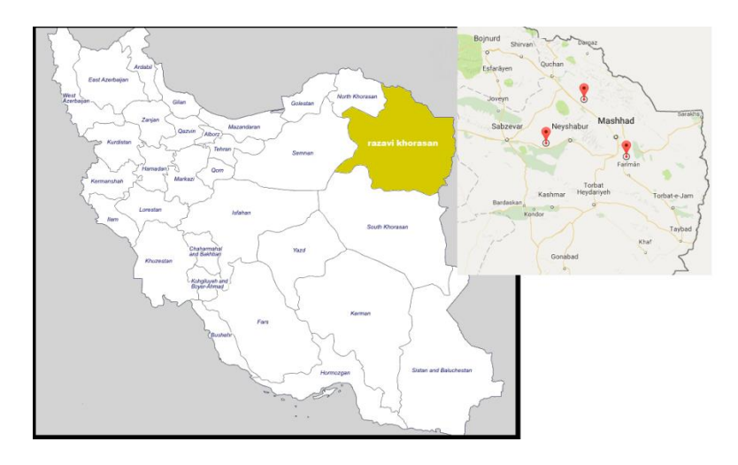
Fig. 1: Three geographical regions in northeastern Iran collected carcasses of stray dogs, where the carcasses of stray dogs were collected

This cross-sectional study was performed from Jun 2014 to Apr 2016. Overall, 192 stray dog carcasses killed due to road accident, were collected. All sampling was done by a veterinarian and postmortem changes were seen carefully. Dead time was estimated between 12 and 24 h ago. These roads were located in north, south and west of Mashhad City (Fig. 1). A questionnaire was completed for each dog, recording clinical signs of VL such as skin lesions, cachexia, and hepatosplenomegaly. Spleen and liver samples were obtained and kept in bottle containing 70% ethanol. They were transported to the molecular laboratory at School of Medicine in Mashhad University of Medical Sciences.