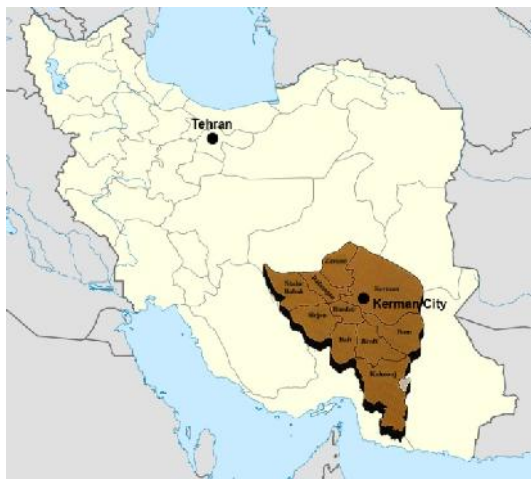
Fig.1: Kerman province and city

The lifestyle patterns are typically aggregated in families. In 2005, as part of the national survey on non-communicable disease risk-factors (NCDRFs) in Kerman province, 1614 inhabitants aged 15 to 64 years were recruited. The familial aggregation of NCDRFs such as physical inactivity, obesity, high blood pressure, hypercholesterolemia and high blood glucose with a risk ratio of 1.5 to 3.5 have been reported in a study published in 2007(2).