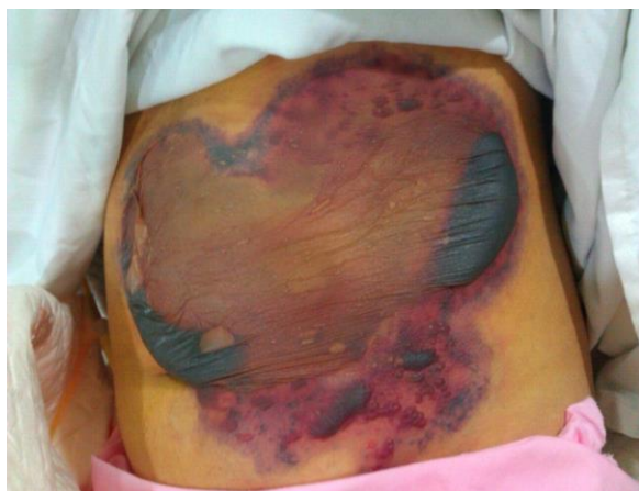
Fig. 1: Erythematous plaque with hemorrhagic bullous lesion on abdomen

lower abdomen spreading to medial part of right shin. The cough and rhinorrhea were begun since 20 d ago and two weeks later the erythematous plaque with hemorrhagic bulla was presented in lower abdomen (Fig. 1). Three days after admission, the skin lesions were extended and the abdominal pain was initiated.